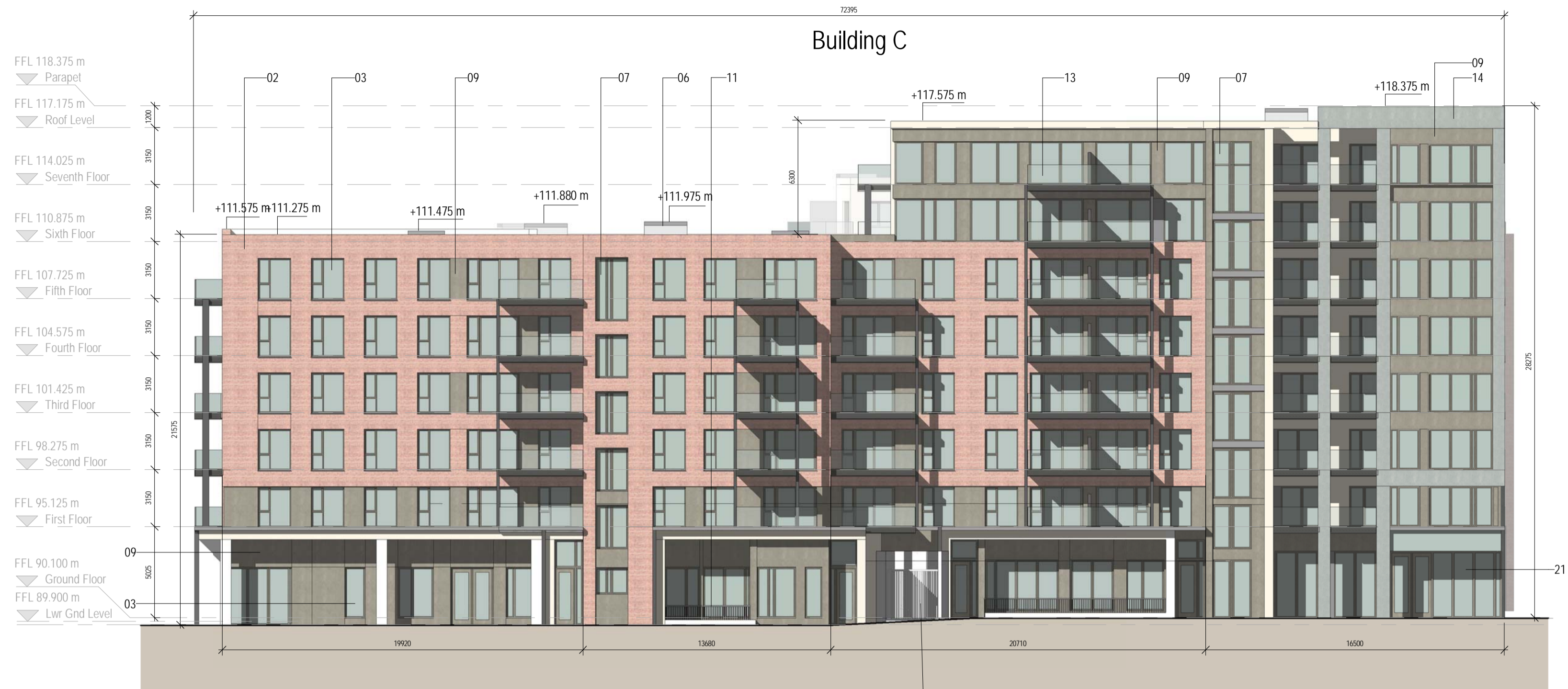
01 East Elevation 1 : 200

ALL DIMENSIONS ARE TO BE CONFIRMED ON SITE DIMENSIONS ARE NOT TO BE SCALED FROM THIS DRAWING THIS DRAWING IS TO BE READ IN CONJUNCTION WITH CONSULTANTS DRAWINGS ALL WORK TO BE CARRIED OUT IN ACCORDANCE WITH CURRENT BUILDING REGULATIONS